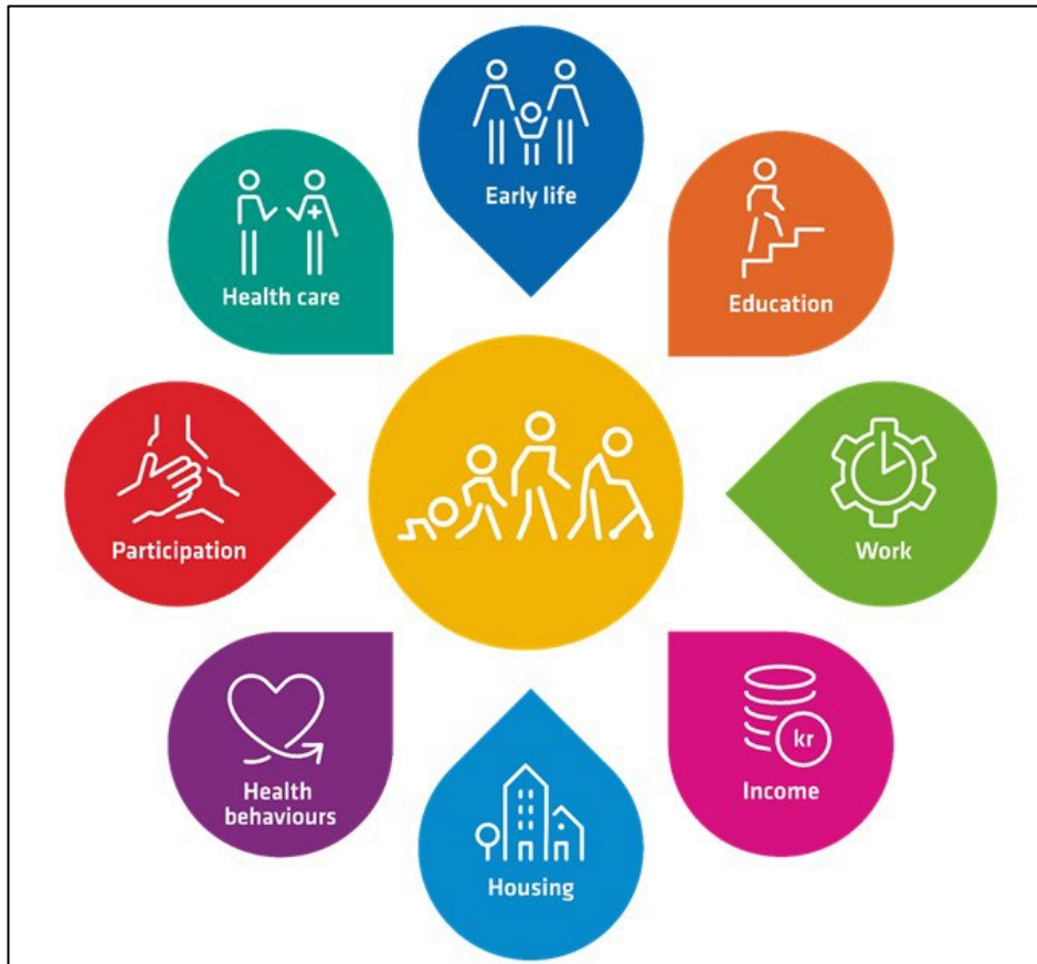
Figure 1 The eight target areas of the public health policy

Each target area describes the most important factors affecting people's health, highlighting the social determinants of health and a life-course perspective. The national public health policy emphasizes the need for long-term, goal-oriented, and cross-sectoral work at all levels of society in order to achieve good and equitable health for all.